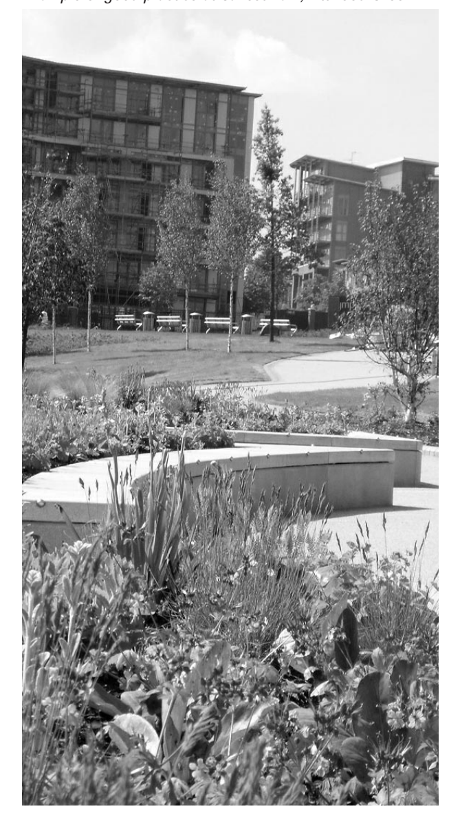
Example of good practice at Sunset Park, Attwood Green.