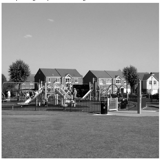
Example of good practice at Paget Green.

The key aim of large scale redevelopments is to achieve a good quality environment overall coupled with a good housing stock. Examples of these large scale redevelopments are; Highgate, Ley Hill, The Radleys. Provision of good quality public open space is an essential part of this. As a general principle, where no net increase in the number of units is proposed and where the quantity of provision is adequate there will be no requirement for further public open space, but qualitative improvements to existing provision will be sought. However on large sites, where there is insufficient public open space, redevelopment proposals will be expected to include new public open space to serve the development in line with the UDP standard. Where a site is being redeveloped with more than the existing number of dwellings new public open space to serve the extra dwellings, using the formula referred to above, will be required. Redevelopment does allow the opportunity for poorly located open space and children's play facilities to be sited more appropriately. The overall amount and the quality of open space is an important factor for consideration on redevelopment sites.