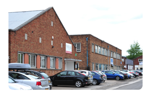
🧰 5. Tyseley Industrial Estate