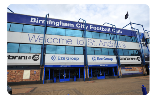
🔯 2. Birmingham City Football Club