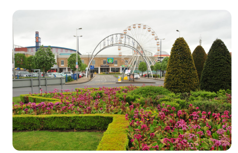
🔼 1. Alexander Stadium