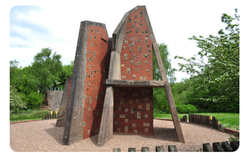
o 4. The Ackers