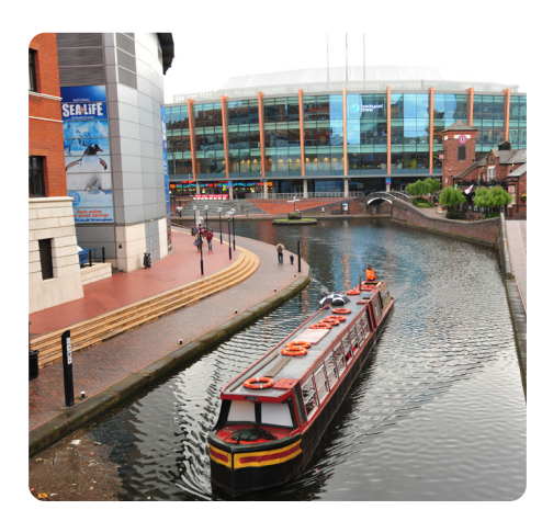
🚺 4. Utilita Arena / Sealife Centre