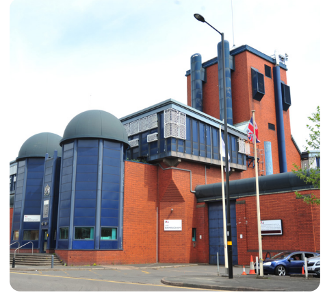
🔯 2. HMP Winson Green