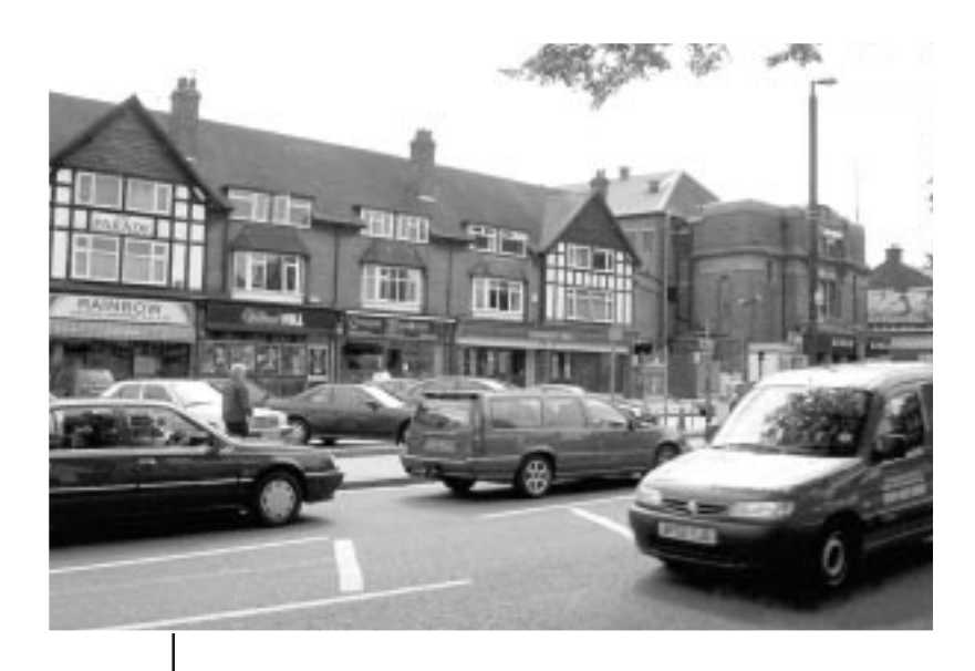
The Parade, High Street

The new developments will be focused around a new community square and could provide a setting for a variety of activities from formal church events to a farmers' market. The new square will serve the wider community and it will be essential to safeguard the provision of public toilet facilities. The proposals will also include improvements to the road junction for pedestrians and also the bus showcase route. The City Council supports the principle of this community project and is in active discussions with the Church and development partners to secure its implementation.