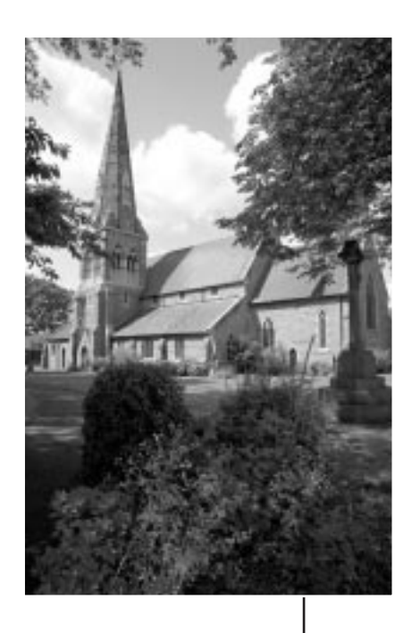
All Saints' Church

All Saints' Church is a Grade II Listed Building, which along with its green spacious setting provides an important focal point for King's Heath. The church is proposing to expand the existing facilities and create a new community centre within the church grounds. This will comprise the relocation of the existing doctors surgery at 1 Vicarage Road, pharmacy, elderly persons and youth facility, café and a new vicarage. This will involve the demolition of the existing vicarage and church hall. Planning permission for the development was granted in lanuary 2005.