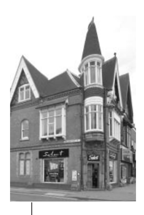
141 High Street

10.3 There are a number of buildings of architectural merit along the High Street, which are being considered for the Local List or even Statutory Listing. These include King's Heath Baptist Church, HSBC, 96 High Street and Select Clothing at 141 High Street.