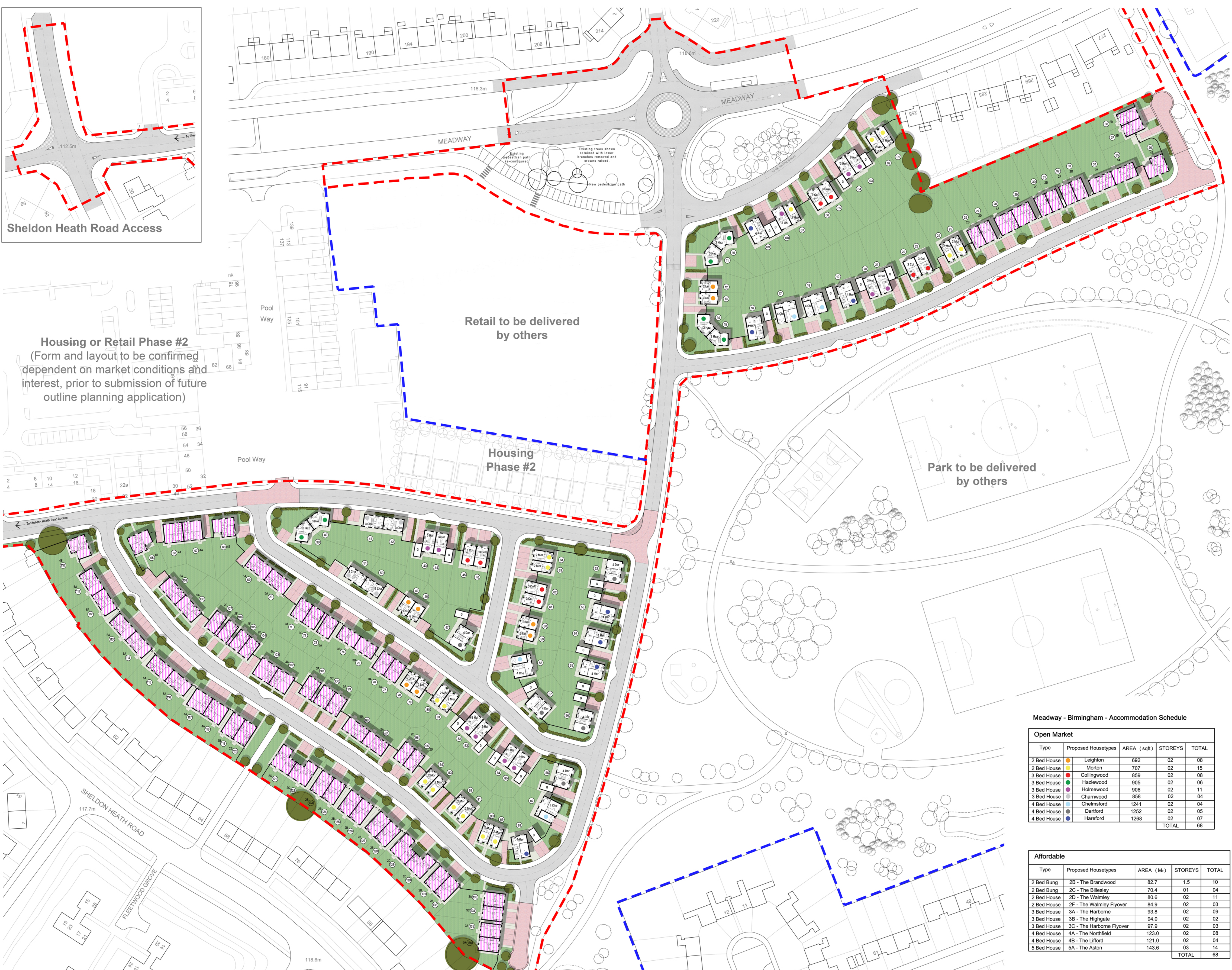
Meadway - Birmingham - Accommodation Schedule

Housing or Retail Phase #2 (Form and layout to be confirmed dependent on market conditions and interest, prior to submission of future outline planning application)