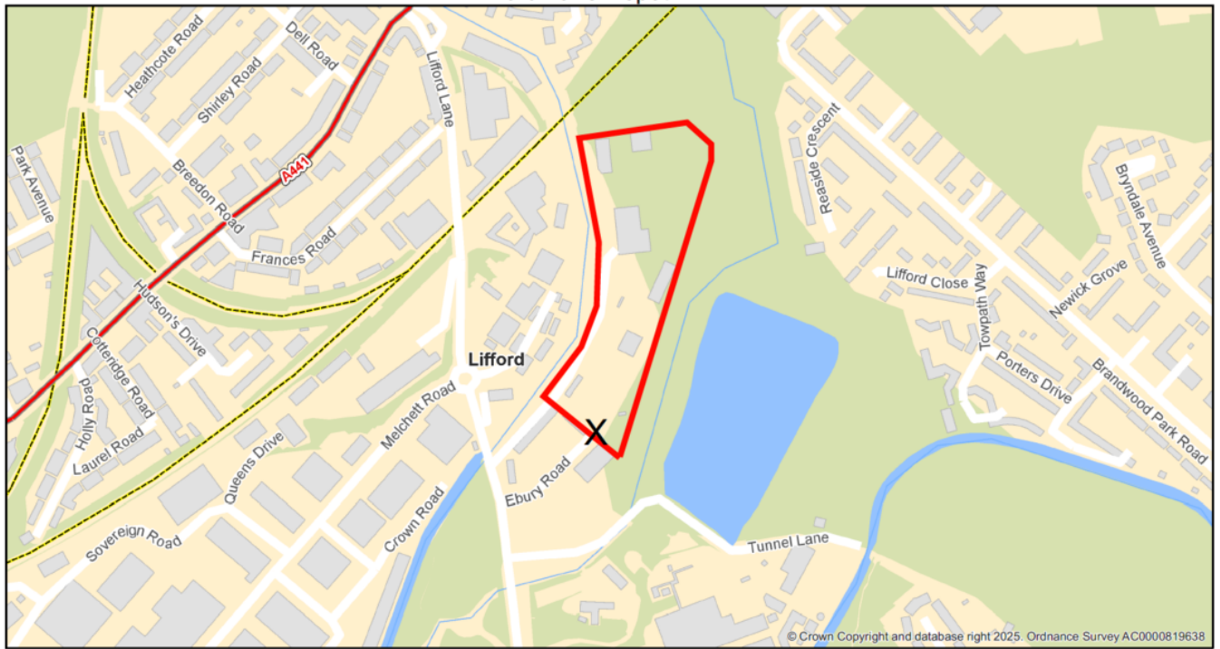
Lifford Lane Depot