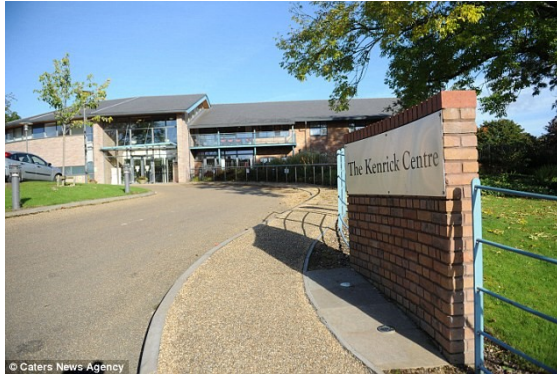
The Kenrick Centre