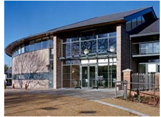
The Perry Tree Centre