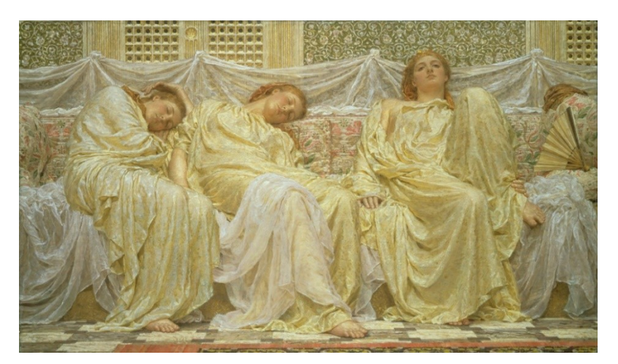
Albert Moore, Dreamers

Corporation Art Gallery, namely Albert Moore's Dreamers . <sup>48</sup> Chamberlain had greatly admired this piece, and its title might remind us of how the newspapers reported on the original plans for a Shakespeare collection: 'these works of the dreamer will rest in a town where to dream in the day-time has always been regarded as a crime'. <sup>49</sup>