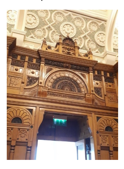
The Shakespeare Memorial Room, 2021.

depict performance images, where Troilus and Cressida are depicted taking a curtain call, for example.