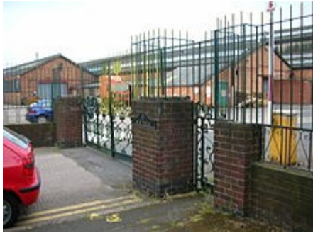
Figure 1: Hay Mills Wire Factory

using 30,000 miles of wire (1,600 tons), made by 250 workers over 11 months. The strengthened wire also made possible the construction of aeroplanes and automobiles. The company today also makes springs. The area is also home to Tyseley Energy Park (TEP), on land owned by the Webster and Horsfall Group, which is at the heart of Tyseley & Birmingham's Energy Innovation Zone (EIZ). EIZs have been designated across the West Midlands to provide commercially meaningful geographic areas for deploying integrated smart energy solutions.