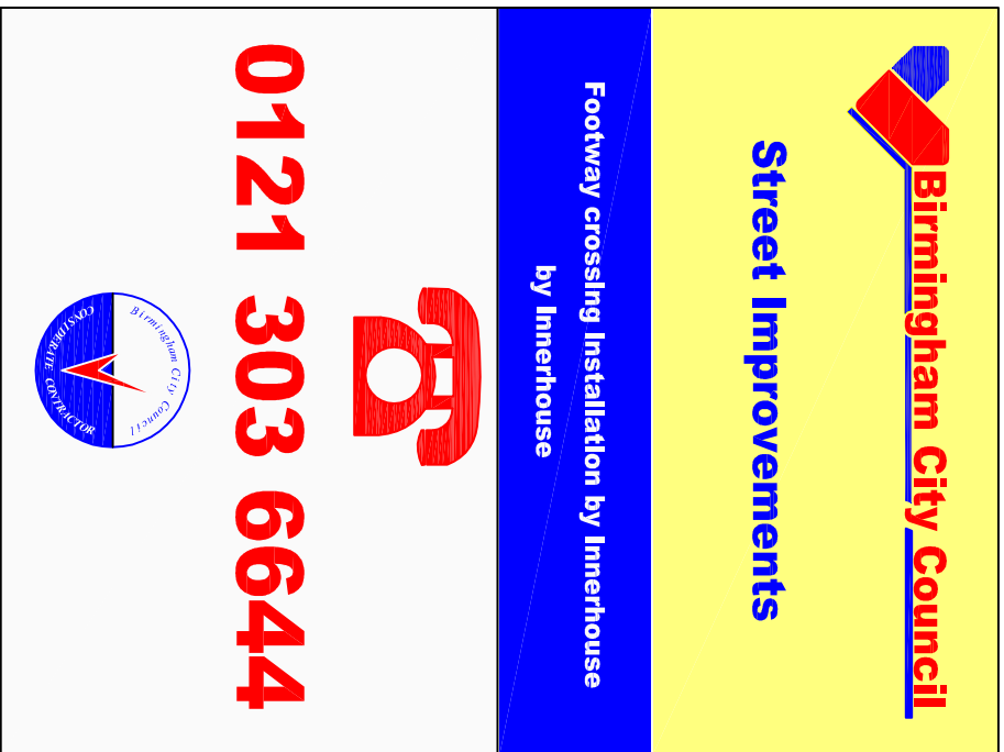
TYPE HA - SEE NOTE 4