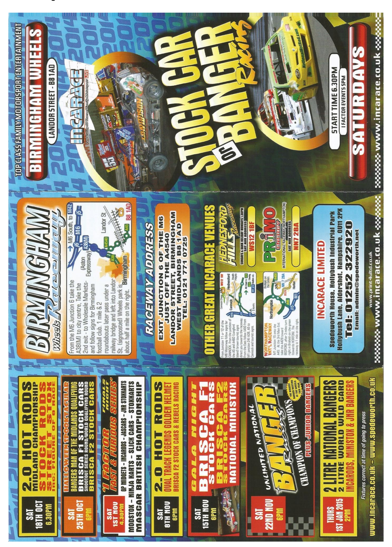
Annex 1 – Birmingham Wheels Oval Racetrack – Fixture List 2014