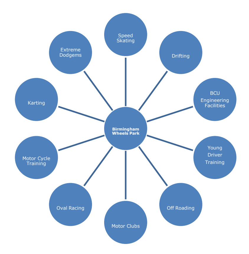
Figure 1 – The sport and leisure activities taking place at Birmingham Wheels Park

Below we provide a summary of the usage of the various component elements of Birmingham Wheels Park. The Licensees suggest that the intensity of usage make the facility one of the most important sports and leisure-related venues in Birmingham, the significance of which has, and remains, to be seriously under-estimated by the City Council.