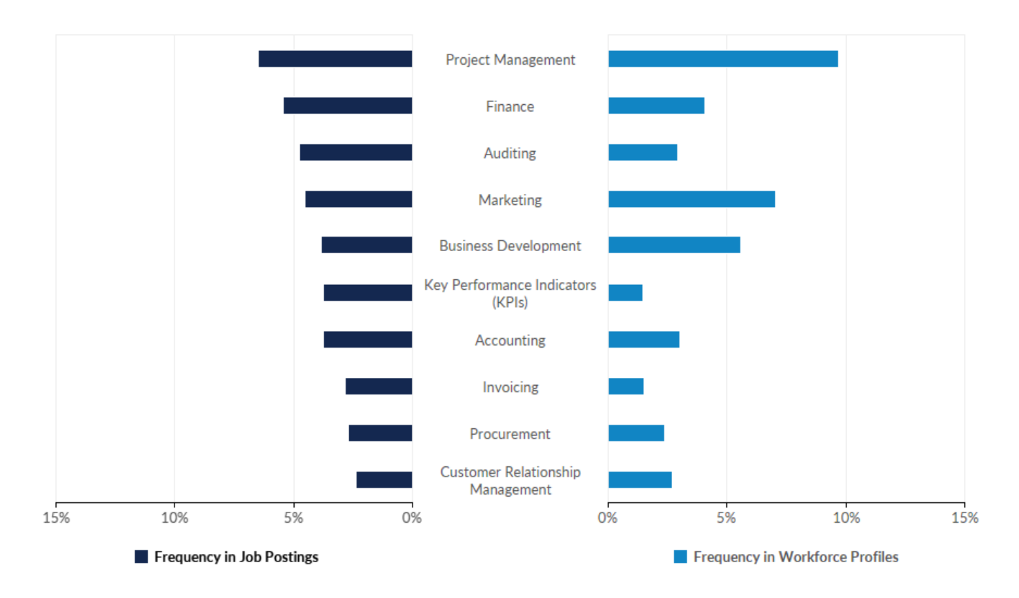
Chart 2. Job Postings by Skill Requirement June 2023