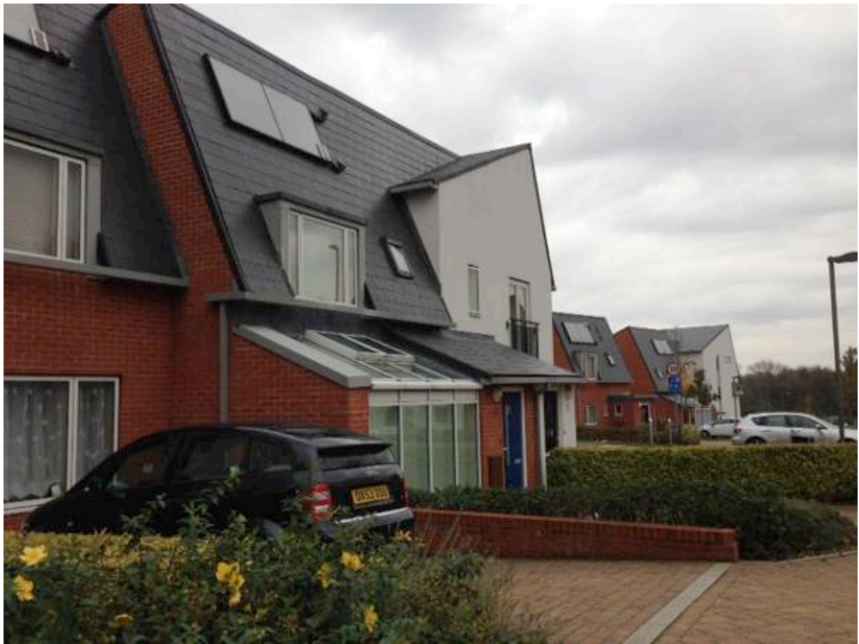
Black Haynes Road