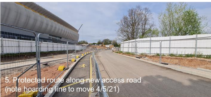
5. Protected route along new access road (note hoarding line to move 4/5/21)