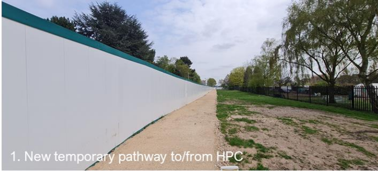
1. New temporary pathway to/from HPC