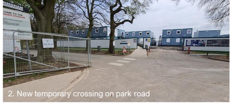
2. New temporary crossing on park road