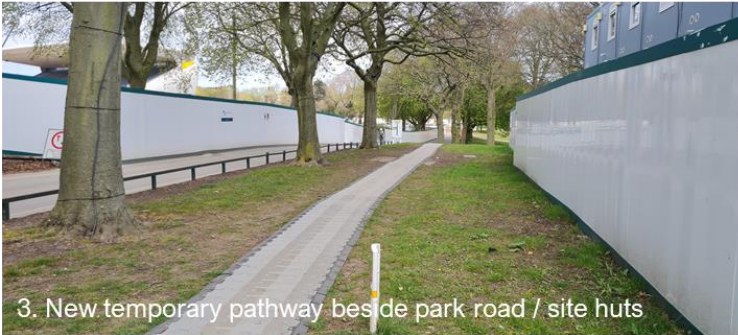
3. New temporary pathway beside park road / site huts