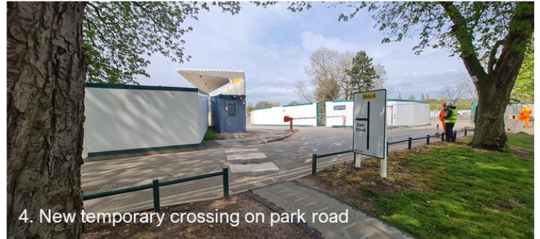
4. New temporary crossing on park road