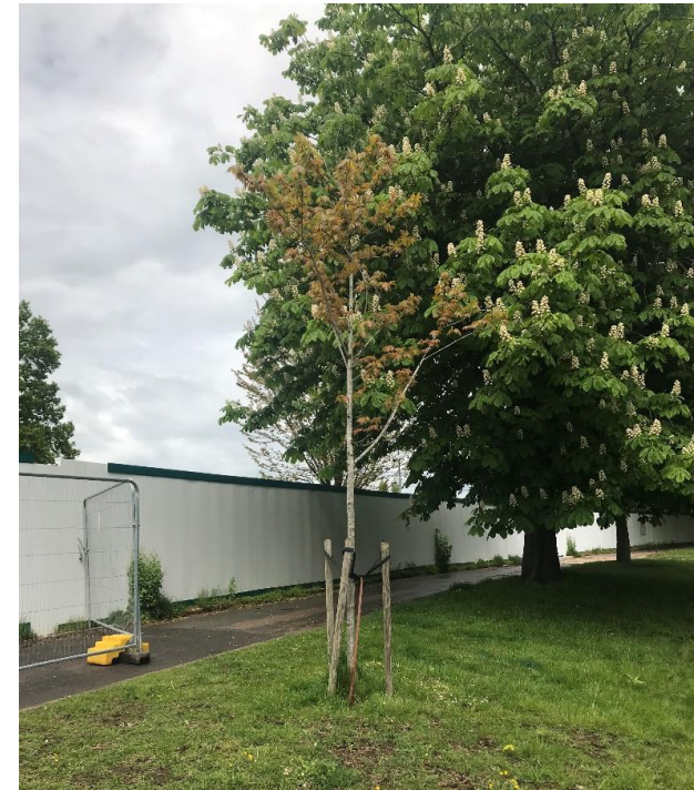
An image of the sapling