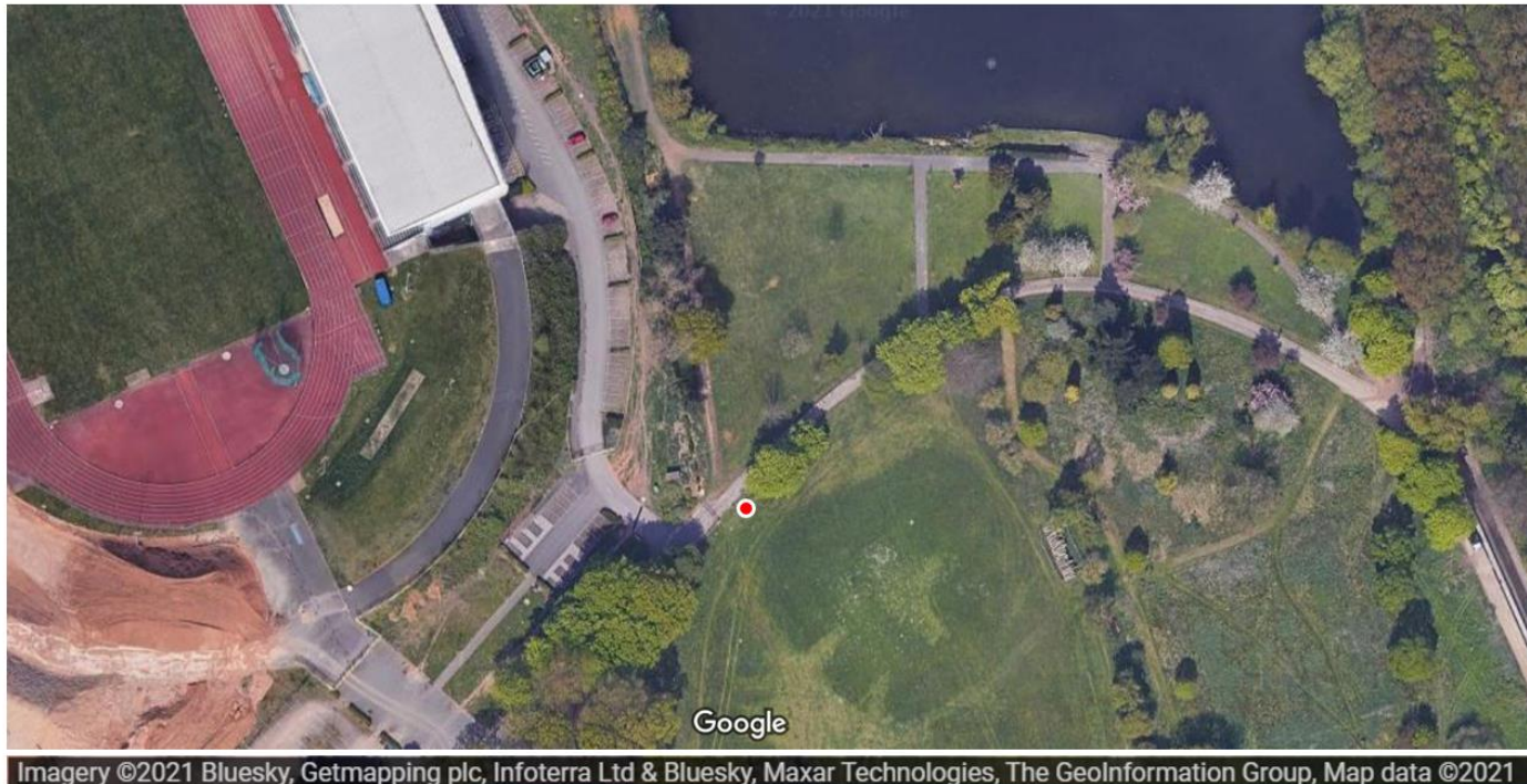
Indicative location of the sapling (in red).

The sapling will be removed week commencing 21st June 2021, and an equivalent sapling will be planted in Perry Park after the Commonwealth Games to compensate for this loss. Our principal contractor McLaughlin & Harvey will first check the sapling for any bird nests, and the sapling will only be removed if there are no nests present.