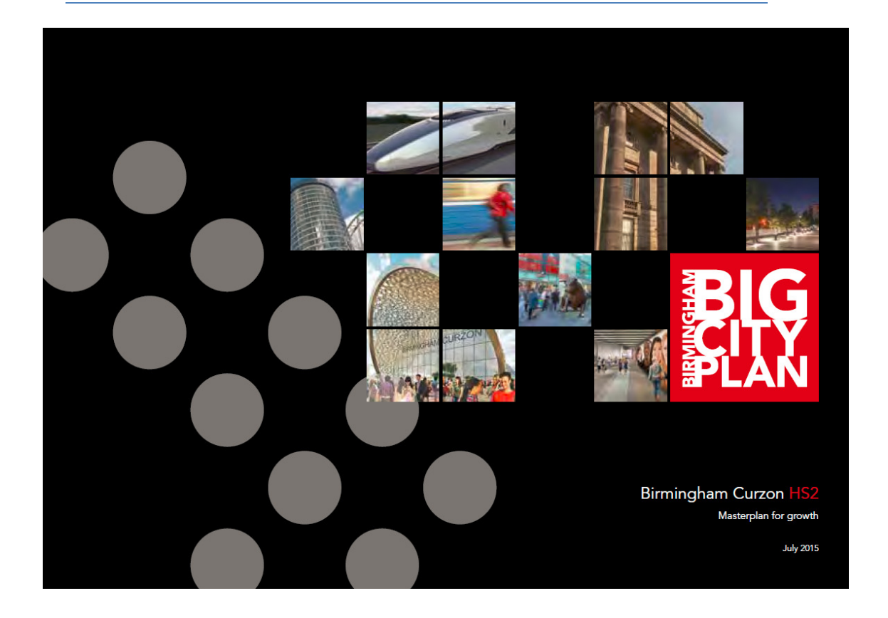
Appendix 5 – Extracts from Birmingham Curzon HS2 Masterplan for Growth (2015)