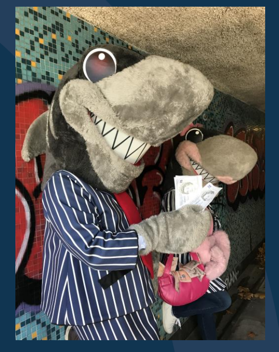
Thanks to all the partners who supported the campaign!

Facebook users also took part in a Stop Loan Sharks photo caption competition. The best captions for the Sid and Glenda photos won a £25 shopping voucher.